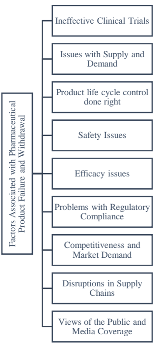
Fig. 2 Factors Associated with Pharmaceutical Product Failure and Withdrawal. Source: Authors' Understanding based on study

ISSN: 2348-5612 | Vol. 11 | Issue 2 | Apr-Jun 2024 | Peer Reviewed & Refereed